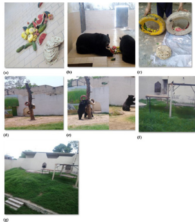
Supplementary Fig. 1. (a) The routine food given to Bears, (b): Bears having their routine meal (indoors), (c): Preparation of feeding enrichment in the zoo, (d): Installed feeding enrichment (Food filled tires), (e): Bears making an effort to get their food, (f): Enrichment 2 consisted of wooden platforms, (g): A bear resting in an enclosure provided with wooden platforms as enrichment.

3 Department of Zoology, Lahore College for Women University, Lahore, Pakistan