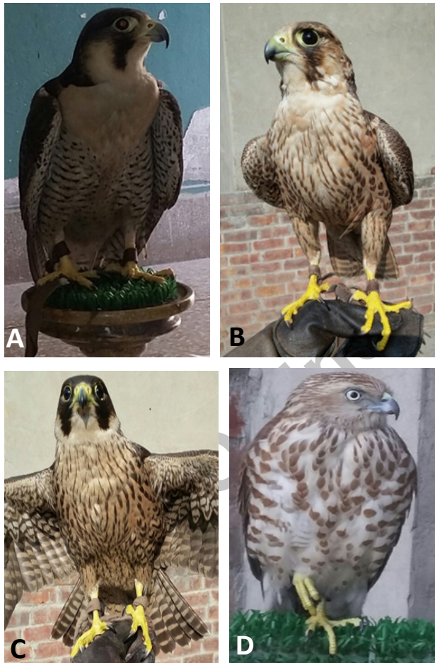
Fig. 1. Predatory birds. A, F. peregrinus (Peregrine falcon); B, F. p. babylonicus (Red-naped Shaheen); C, F. p. peregrinator (Black Shaheen); D, A. badius (Shikra).

nucleotide sequences are not found on NCBI. Our findings compelled us to declare these two members as sub-species of F. peregrinus . Evolutionary analysis among various species of raptors through MEGA11 (Fig. 1). The results exhibited that A. badius is more closely associated with A. soloensis and A. b. poliopsis . Similarly, F. p. peregrinator and F. p. babylonicus has made ingroup with F. peregrinus . Whereas Pakistani F. peregrinus showed relationship with F. peregrinus voucher . The results from phylogenetic tree coincide with the morphological classification of these four species of raptors (Fig. 2). However, it is recommended to explore such species at molecular level further in order to avoid ambiguities.