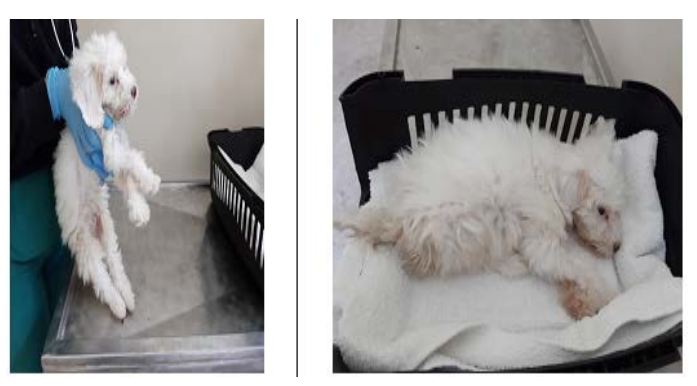
Figure 1: Physical appearance of the dog and difficulty in standing

head tilt and urinary incontinence (Figure 1). In the anamnesis, it was learned from the owner that the dog was unvaccinated, adopted from a breeder a week before, had low appetite since the day it was adopted, and for the last few days before admission, had vomiting and diarrhea. Also, difficulty in standing up and urinary incontinence were noticed by the owner. During physical examination, it was observed that the dog was quadriplegic and had tremor and seizures that exacerbate with stimulation. Also, dehydration (severe enophtalmia and considerable loss of skin turgor), hypothermia (37.3 °C), tachycardia (124 bpm), tachypnea (48 breaths / minute) and hypotension (88 mmHg systolic, 52 mmHg diastolic, 64 mmHg MAP) with pale and dry mucous membranes were observed.