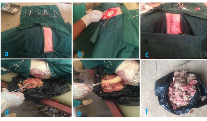
Figure 4: Showing the surgical procedure undertaken. (a) Triangular draping of the surgical field. (b) Incision into the abdomen via the paralumber fossa in order to exteriorize the punctured uterus for lavage and treatment. (c) Removal of the macerated fetus via the external opening. (e) Pulling of the skin remnant from the macerated fetus. (f) Complete macerated fetus removed from the uterus.

An incision was made to extend the opening at the ventral abdomen, and the fetal bones and viscera which weighed 2.6 kg were evacuated. The uterus was thoroughly lavaged using normal saline. After removing the macerated fetus, the uterus was adhered to the abdominal wall firmly. Adhesion was detached, and the uterus was closed with lambert suture pattern using Vicryl (Covenant root Nig. LTD, Shanghai SNWI Medical Co., LTD) size 0. The abdominal muscle layers were closed routinely with Vicryl size 1 using horizontal mattress suture pattern. Finally, the skin was sutured with nylon size 2 using ford interlocking suture pattern (Figure 4).