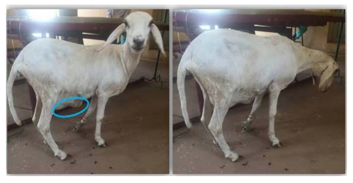
Figure 1: Patient on presentation showing the swelling on the ventral abdominal region.

A one and half year-old Balami-Cross ewe was presented to the Veterinary Teaching Hospital of the Faculty of Veterinary Medicine, Usmanu Danfodiyo University, Sokoto, Nigeria with the complaint of swelling noticed at the ventral abdomen near the udder (Figure 1). The client claimed to have noticed the swelling two weeks before presentation.