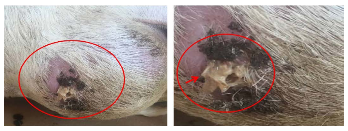
Figure 2: The patient on presentation showing the burst swelling on left lateral recombency. The circumscribed area shows the pus with protruding fragment of fetal bone (arrow head).

The ewe was observed to be alert and active. The rectal temperature was 39.4 °C, pulse and respiratory rates were 83 beats and 100 cycles per minute, respectively. The animal was restrained and placed on left lateral recumbency in order to perform a detailed examination. A reddishgrey foul-smelling discharge was noticed from the burst swelling with protruding bony structures (Figure 2). On examination of the external genitalia, the cervix was found closed with no discharge.