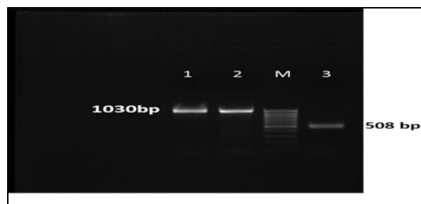
Figure 2: Agarose gel showing the amplification of 1030 bp DNA product of E 3 gene of CAV 2 and 508 bp product of CAV 1; 1- Sample1; 2- Sample2; M-100bp marker; 3- Sample3

but at the same time they may interfere with CAV vaccination (Appel, 1987). Further, a large pool of stray dogs in India is not covered under the vaccination umbrella and urine or faeces of infected or recovered dogs or dogs with sub-clinical form of infection form an important source of CAV- 1 and CAV- 2 (Macartney et al., 1988; Tham et al., 1998). With the reporting of CAV- 1 infections in dogs, it is of obvious suspicion whether the vaccine strain used in the vaccine is effective in protecting against ICH in dogs. Another reason of vaccine failure or ineffectiveness of the vaccination is that as the CAV- 2 is present in the vaccine along with other virus and bacteria and there may be competitive interference /suppression of one antigen by other potent antigen to be processed by the immune system in eliciting the protective immune response. Further, it is to be noted that field veterinarians do not follow either the uniform strategy in vaccinating the pups at the particular age or prior estimating the MDA.