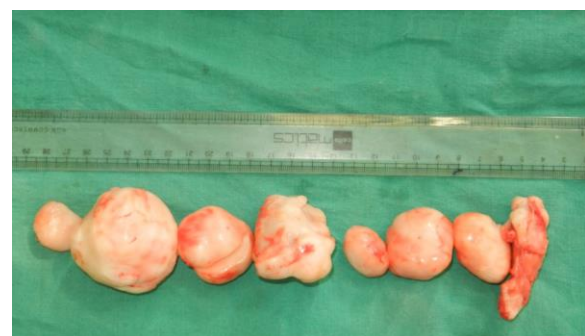
Figure 6: Excised tumours of varying sizes.

The dog was aseptically prepared for surgery, pre anaesthetised with atropine @ 0.04mg/kg, induced with xylazine and ketamine hydro chloride @ 0.8 & 10 mg/kg respectively and maintained with diazepam @ 0.5 mg/kg BW. The animal was catheterised through the external urethral orifice. By caudal mid ventral abdominal incision, the uterus with tumour masses were exposed out (Figure 5) and performed ovario hysterectomy by applying modified transfixation ligatures using No. 0 chromic catgut and the abdominal wound was closed in three layers as a routine procedure. The size of the masses ranged between peanut and big lemon size with glistening capsular appearance (Figure 6). Through episiotomy the remaining growths at