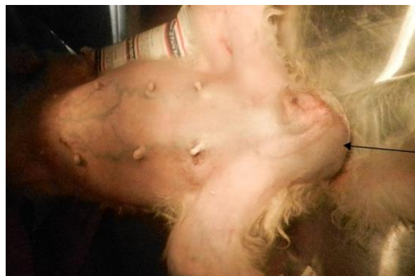
Figure 1: showing extensive growth on perineum (arrow)

Clinical examination showed that, the dog was dull, dehydrated with tenesmus, stranguria, and pollakuria. Pyrexia (104 0 F), tachycardia (140/ min), tachypnoea (46/ min), congested conjunctival mucous membrane were observed. The perineal swelling was very hard (Figure 1). Per vaginal palpation revealed no discharges but multiple hard spherical structures in vestibule, vagina up to the level of cervix and appeared to cause extra lumenal obstruction of urethra. Per rectal examination revealed soft faeces and no growths in the lumen but growths in the vagina were causing extra lumenal obstruction. Few pedunculated growths were observed in the vestibule. The pedunculated growth was sent for biopsy.