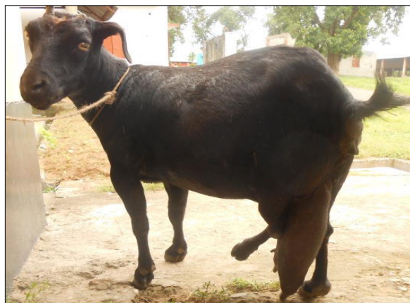
Figure 1: Pendulous and lacerated mammary gland

within the mammary parenchyma (Scott, 2007). Early recognition and prompt treatment are important for limiting tissue damage and production losses. Practically, most of the mastitis cases are well treated with antibiotic injections as well as antibiotic teat infusions. In cases where medicinal treatment is obsolete, unilateral or bilateral mastectomy is recommended as a pain relieving procedure for extensive lesions involving udder and in cases of chronic mastitis, gangrenous lesions or neoplasia (Cable et al., 2004). The present case report describes bilateral mastectomy for the management of chronic suppurative mastitis in a suffering mastitic Black Bengal doe.