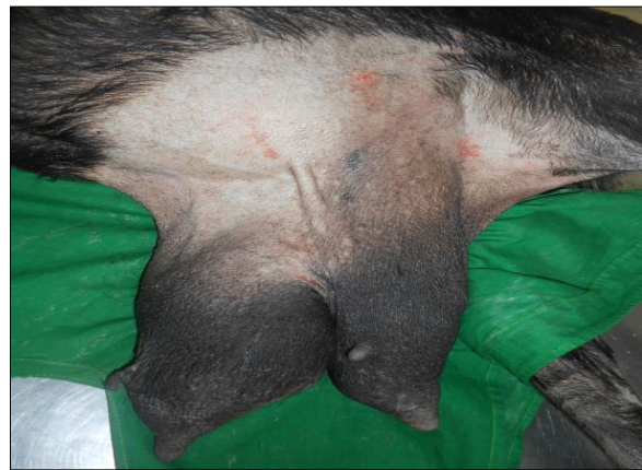
Figure 2: Preparation of site for surgery (Balloon like gland)