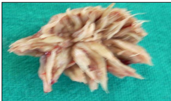
Figure 3: Surgically excised tumour mass

After two months of surgical treatment, the same animal presented with same type of growths in prepuce and left paw region (Figure 4 & 5). Radiography of thorax was performed and revealed no evidence of metastasis. Excisional biopsy of these growths also confirmed the same tumour type and consequently the tumour growths were surgically removed as described earlier using the same anesthetic protocol. Since the tumour was multicentric and malignant in nature, it was decided to combine chemotherapy along with surgical removal. Cyclophosphamide (Cyphos®) @ 50 mg/m 2 IV was given at weekly interval for 3 weeks. The skin sutures were removed on 10 th postoperative day and the animal showed no recurrence of tumor at different surgical site during the follow-up period of two years (Figure 6).