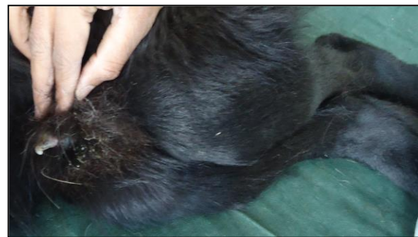
Figure 4 and 5: Recurrence of same type of growth at left paw and prepuce region in same animal after two months of surgical excision