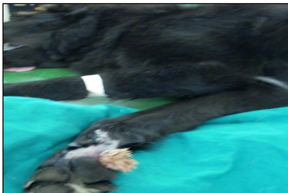
Figure 1: Flower like tumour growth at right paw in a nondescript male dog

A one and half year old, male non-descript (Bhutia) dog was brought to Institute Referral Veterinary Polyclinics with the history of limping and a unique flower shaped growth in right fore-limb since a week. On physical examination, the growth was found to be pinkish, hairy with irregular contours and tender on palpation, firmly attached to the skin and well demarcated from other tissues (Figure 1).