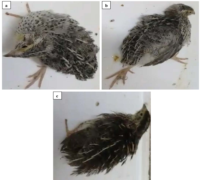
Figure 1: Clinical signs of infected quails with velogenic class II genotype VIb NDV strain (EG/SR/76/CH/1967) at 6 dpi. The infected quails showed torticollis (a), paralysis of the legs (b) and ruffling feather (c).