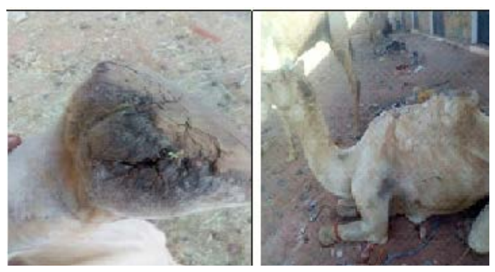
Figure 2: Some important clinical signs noticed in examined camels; foot edema (a) and emaciation (b).

Out of the 92 camels participating in the study, 36 were apparently healthy and 56 were clinically suspected experiencing some of the clinical signs suggesting T evansi infection, such as emaciation, powerlessness, conjunctival mucous membrane changes either paleness or congestion, superficial lymph nodes augmentation, edema of distal extremities Figure (2). Out of these clinically suspected cases, 34 gave positive by PCR and the most reported clinical findings in such 34 clinically affected camels were illustrated in Table (1).