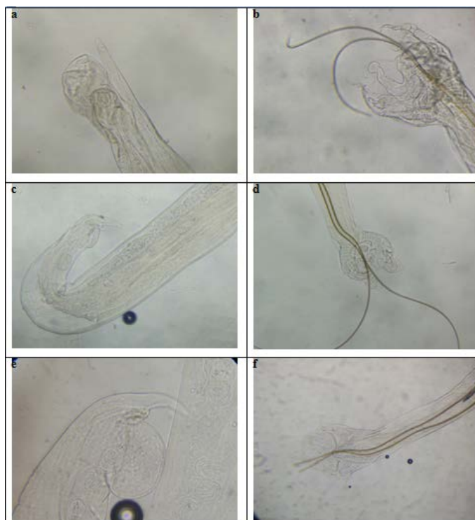
Figure 2: Morphological features of the caudal end of the three Metastrongylus species collected. M. salmi (a: female, b: male); M. confusus (c: female, d: male); M. pudendotectus (e: female, f: male).

Data obtained were analyzed using Fisher's exact test (ver-