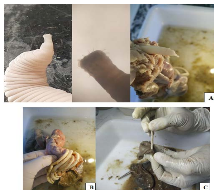
Figure 3: M. hirudinaceus : A head of adult worm, B intestine with a heavy worm burden, C adult worm embedded in the intestine wall.

the guts wall, which can result in fatal peritonitis (Diana Gassó et al., 2016).