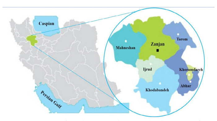
Figure 2: Map of study area indicating the location of site where Siahmazgi cheeses were collected.

Totally 76 Siahmazgi cheese samples were collected randomly from different regions of Zanjan province-Iran during the years of 2017 to 2018 (Figure 2). The method of choosing a sampling place was based on the highest level of factories and the highest amount of cheese production. According to the Institute of Standards and Industrial Research of Iran (ISIRI) NO.326, at least 100 g of each sample were collected in sterile bag (Persian ZipKeep Co., Tehran, Iran) and kept under adequate refrigeration condition (1-5 °C) until analysis (ISIRI, 2009b). Each sample was divided to microbiological and chemical analyses. All the experiments were carried out in triplicate (Nespolo & Brandelli, 2012).