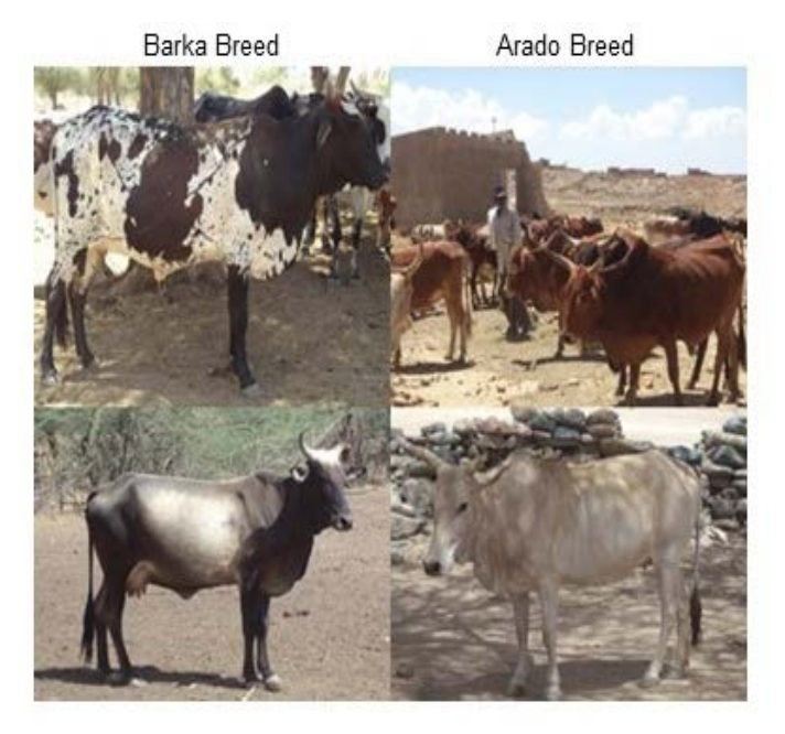
Figure 2: Photos of the two cattle group identified in the analysis

Classification of cattle populations based on specific agro ecological zones was carried out in order to evaluate diversity within the animals in similar ecological condition. The Highland cattle populations formed two clusters with the first comprising of cattle populations from Serejeka, Sheib-Seleba, Hamelmalo, Sheha, Habero, Mai-alba, Zighb and Afelba while Cheguaro population formed a