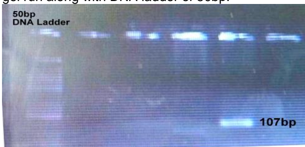
Fig.1: Gel Electrophoretic analysis of PCR samples; 107bp band representing PCR amplicon of TNF- \alpha -308 selected region.

Amplification yielded 152bp PCR product of -308G/A fragment visualized by using 2% agarose gel run along with DNA ladder of 50bp.