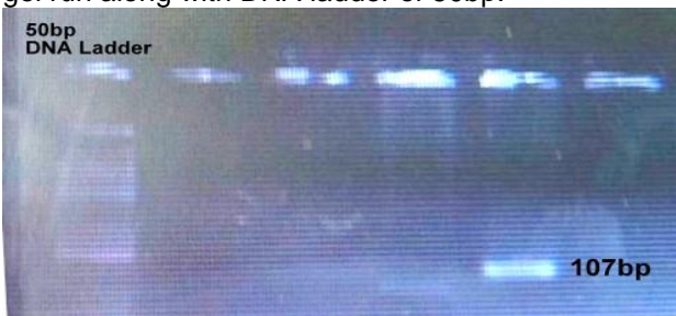
Fig.1: Gel Electrophoretic analysis of PCR samples; 107bp band representing PCR amplicon of TNF- \alpha -308 selected region.

Amplification yielded 152bp PCR product of -308G/A fragment visualized by using 2% agarose gel run along with DNA ladder of 50bp.