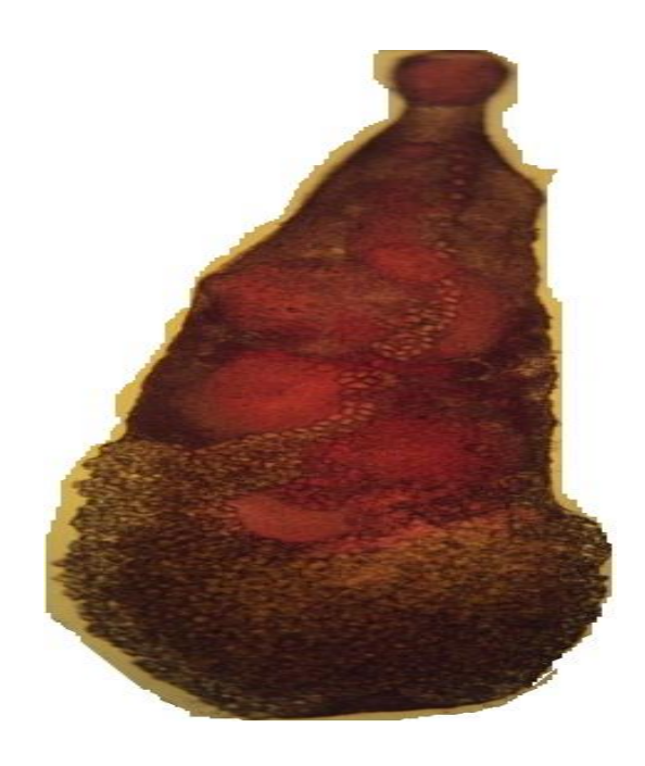
Fig. 2: Aphanururoides lethrini. Photograph of entire worm