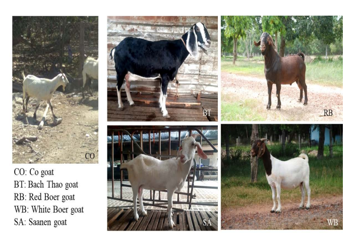
Figure 1: Representative images of goats. CO: Co goat; BT: Bach Thao goat; RB: Red Boer goat; WB: White Boer goat; SA: Saanen goat.

bp in the hypervariable region was magnified by the primer set (5'-3') as forward (TCCCACTCCACAAGCCTAC) and reverse (TAGGTGAGATGGCCCTGAAG).