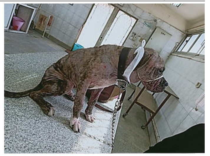
Figure 2: Dog showing generalized demodicosis.

Microscopic examination findings of multiple, deep skin scrapings from affected areas were shown in Figure 3. Skin biopsy specimens showed severe histopathological lesions of demodicosis. These lesions summarized as heavy mites infestation in different developmental stages in the stratum conium of the epidermis and in the follicles. Laminar orthokeratotic hyperkeratosis, vacuolated epidermal prickle cells, acanthosis and vaculation of keratinocytes of the infundibula. Furthermore, the dermis showed dermatitis characterized by moderate to marked inflammatory infiltration of the dermis by macrophages, lymphocytes and eosinophils. Necrosis of adnexa, folliculitis and per folliculitis were also recorded in examined cases as showed in Figure 4.