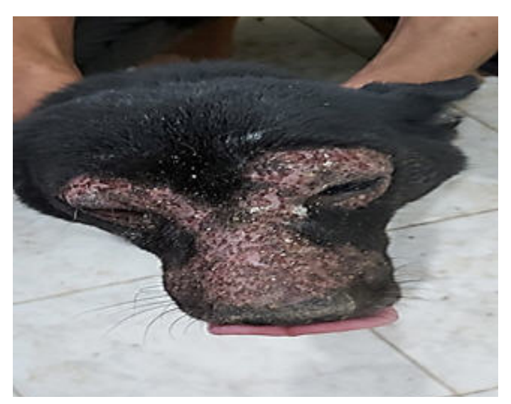
Figure 1: Dog showing localized demodicosis.

During careful scrutinization of demodicosis infected dogs, the most obvious clinical signs were erythema, scaling, alopecia, papules, and pustules of one body region as shown in Figure 1 or more severe as shown in Figure 2 that showing complete alopecia, furunculosis, crusting, exudation and ulceration with focal draining tracts with offensive odor of the skin.