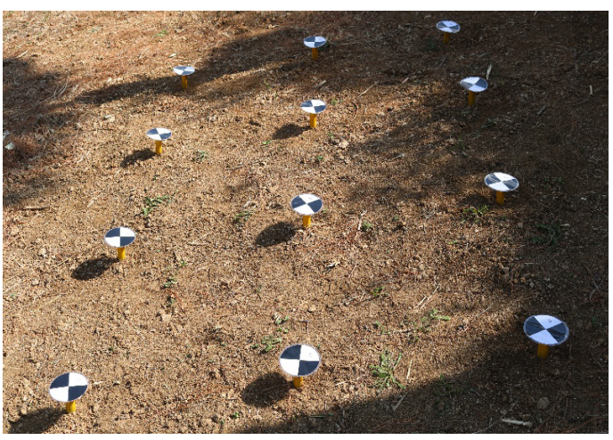
Figure 2: Erosion pipes installation in moderate forested area.

each point. The soil sampler was placed over each point with sharp edge pointed ward. It was driven into the soil with the help of a hammer. The sample tube along with a core of soil was dug out by removing the soil around the sample tube. Cotton cloth was used to cover soil sample and fastened with rubber bands on both sides. Sample tube was enveloped in a polythene bag. The entire fifteen samples (five from each zone) were taken in the same manner and brought to the laboratory.