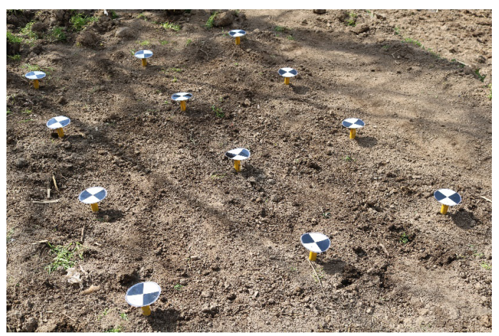
Figure 3: Erosion pipes installation in agricultural land.

The sample tubes were soaked in the sink for saturation overnight keeping the level of water just below the upper edge of the sample tube. The cloth on both sides of the sample tube was removed. Sampler was set up on perimeter after replacing cloth with wire mesh on lower side. The discharge was measured for 20 minutes after the flow of water through the soil core becomes constant. An average of four measurements gave the infiltration rate as the discharge was measured after every five minutes separately. Soil infiltration capacity was determined by using the following equation;