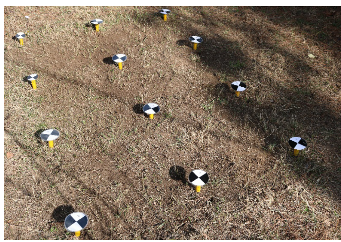
Figure 1: Erosion pipes installation in dense forested area.