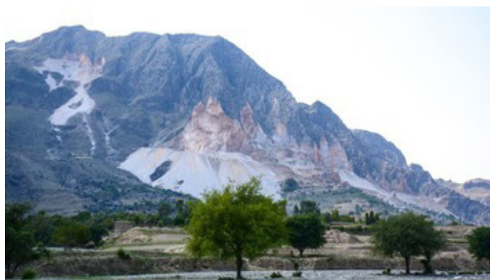
Figure 3: Marble quarry sites in Mohmand Ex-Agency.

of excavated marble goes to waste in the form of crushed material (50-60%) (Figure 4). Stripping outcrops and improper disposing off the wastes, is another major source of wastage. It is observed in the field visits that most of the mines are in their initial stages and working in the loose and immature portion of the deposit where prodigious quantity of minor and major cracks causes a major portion of the wastes at mines. This waste goes on accumulating at the quarry sites and causes multiple problems including higher handling costs and difficulties in further mining. Sometimes, higher percentages of wastage forces the mine operators to close further mining. For example, in District Buner in 2003, out of 225 marble leases only 47 were in operation and rest of the quarries were closed due to different reasons including overlying waste near the face (Inspectorate of Mines, KP, 2019).