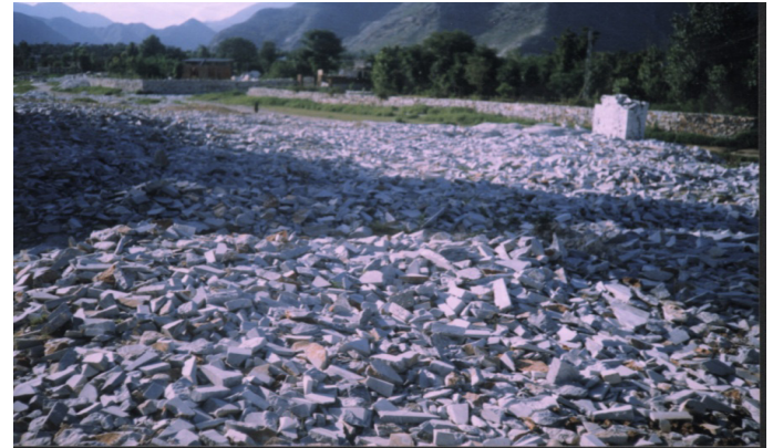
Figure 8: Waste produced as a result of marble processing in a processing unit in District Buner.

uncontrolled blasting, use of high explosives and irregular drilling patterns, many cracks and micro fissures develop both in the blocks as well as remaining faces which further reduces quality and durability of the finished products (Figure 9). The micro cracks further develop with the use of the marble tiles especially in floors.