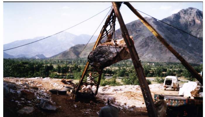
Figure 2: Blocks loading with the help of a simple winch machine used in Buner area.

It is an established fact that substantial investment is needed for developing a mine as per international standards. Huge machinery such as diamond wire saw, chain saw, loader, dumpers, and excavators etc. are needed to develop a dimension stone quarry properly. The only mechanization that can be seen at the marble quarries is in the shape of handheld drills, locally fabricated winches for loading blocks (Figure 2) and compressors. Therefore, the mine operators are forced to excavate small blocks that can be handled easily with the existing machinery.