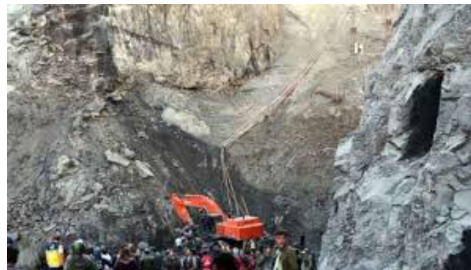
Figure 5: Accident occur due to high and hanging working face fall at Ziarat marble quarry, District Muhmand in September 2020.

increase the production cost, which ultimately affect the market trends. Also due to inexistence of proper roads, schools, hospitals, and colonies for the workers, they hesitate to work in the mines and thus the mine operators will have to rely on the locally available limited number of labor most of them are non-technical.