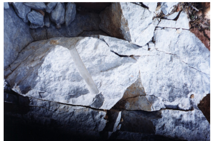
Figure 9: Cracks developed in the block due to indiscriminate blasting under the existing mining techniques in District Mardan.