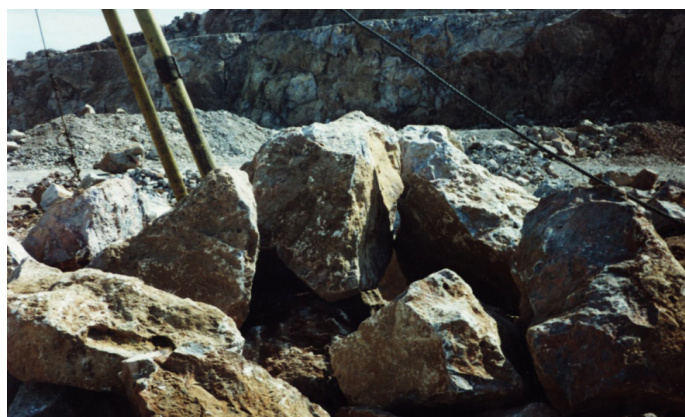
Figure 7: Irregular/potato shaped blocks (waste) produced during existing marble extraction techniques in District Nowshera.

Due to centuries old irregular drilling and blasting method and consequent fall of large boulders under gravity from heights, irregular shaped boulders and lumps in varying sizes produce (Figure 7). Under existing mining practices, it is extremely difficult to control over this phenomenon and hence the quality of raw marble significantly affects. Consequently, it becomes one of the major sources of waste production at mines as well as processing units (Figure 8). If by chance, a large boulder is extracted then a great problem is faced in handling the boulder with a simple winch machine or manually which is then further blasted into smaller pieces and become a source of further waste production.