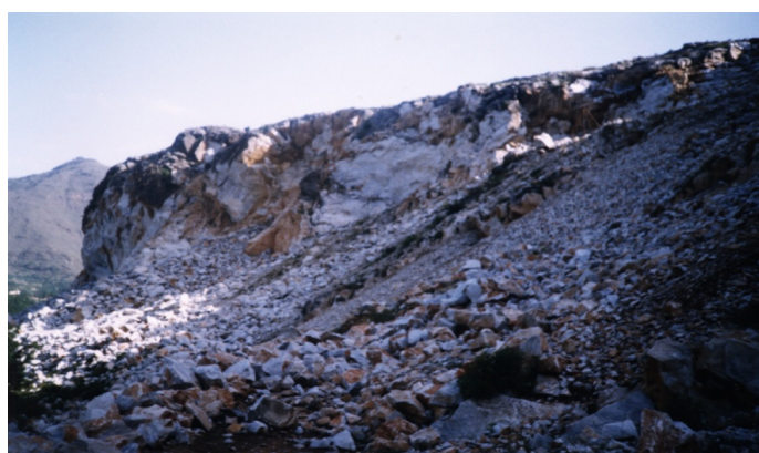
Figure 4: Five working faces were closed due to accumulation of waste on the sites in district Buner.