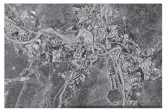
Plate 1: Proximity of settlements to Khyber Stream

the people are economically poor and cannot manage accommodation somewhere else in safe area. Jaba village is located at the confluence of Chora River and Khyber Stream, the people have been asked by the government to vacate the site for the construction of a proposed dam. Hence, in Jaba the people have no option other than to leave the area and shift to other localities. In Chora and Qadam most of the settlements are distant from river and streams and are not highly vulnerable to floods. The agriculture lands are very close to river channel but they have protected their lands from floods to a large extent through embankments. Hence the people didn't prefer to leave their native locality and community. Moreover, the people in the study area are economically weak and cannot afford to shift to other locality. Hence, majority of the people had strong affinity towards their native land in spite of flood risks (Table 5).