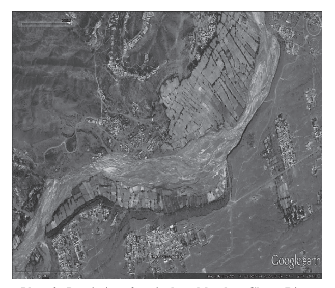
Plate 2: Proximity of agricultural land to Chora River

Human perception of floods has an important role in decision-making regarding floodplain utilization. The level of perceptions was uniform throughout the flood affected area. Floods were perceived as disastrous hazard in the study area. People of the area definitely perceived the occurrence of future floods, and flood season but they didn't know which year it would exactly occur. Majority of the people in the area perceived the flood damages as substantial to settlements and infrastructure along the Khyber Stream and to agricultural land along the Chora River channel. Floods frequency had increased with the passage of time in the area. Almost all the people preferred to stay in their native localities and communities regardless of flood risks. People had adopted adjustment