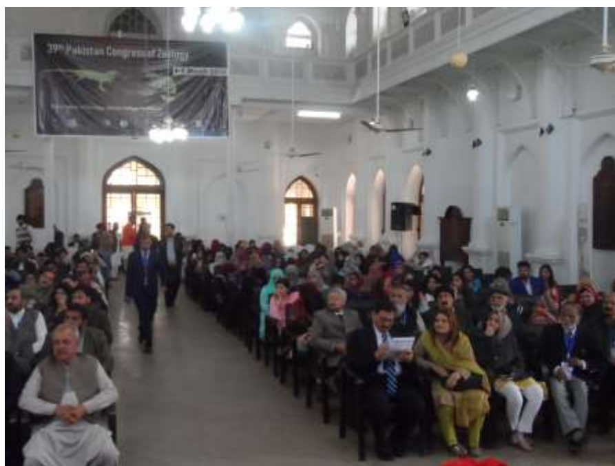
Section of audience during inaugural session