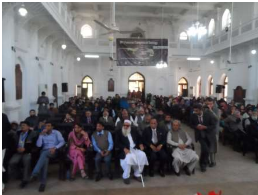
Section of audience at the Inauguration Day of PCZ