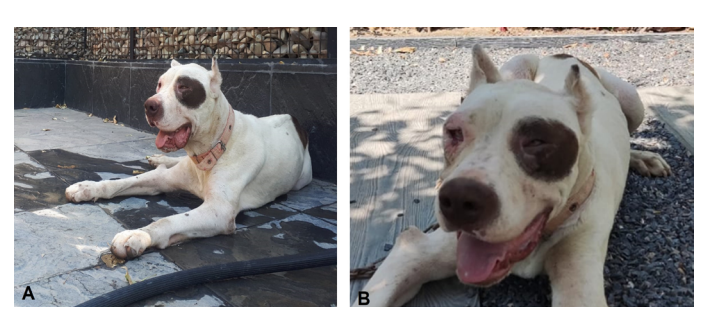
Figure 2: Improvements in animal's condition after three weeks of treatment.

showed that the animal regained its vision completely 2012). (Figure 2).