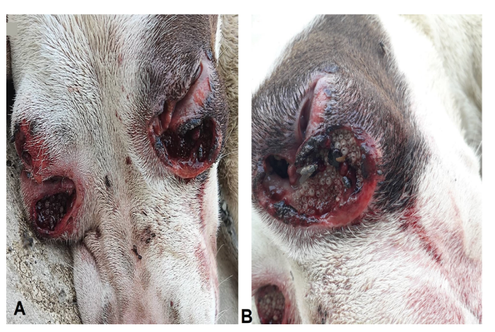
Figure 1: Clinical manifestation of orbital myiasis in an anesthetized Pitbull dog before treatment (A and B).

mainly in the ocular bulbs, lower eyelids, and orbital cavities (Figure 1). A close-up examination revealed the infestation with maggots, unpleasant smell, edema, erythema, ulcers, and necrotic tissues. The orbital walls of both eyes were almost not visible because of massive larvae over the eyes. The body temperature was 40.5°C representing fever.