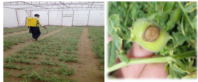
Figure 1: Spray of inoculum in Ascochyta blight screening nursery and symptoms of AB during pod bearing stage.