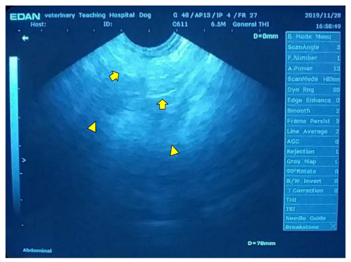
Figure 2: Hyperechoic focal echogenicity (arrows) creating distal acoustic shadow (arrowheads) in the dependent portion of the bladder, confirming the presence of cystic calculus.