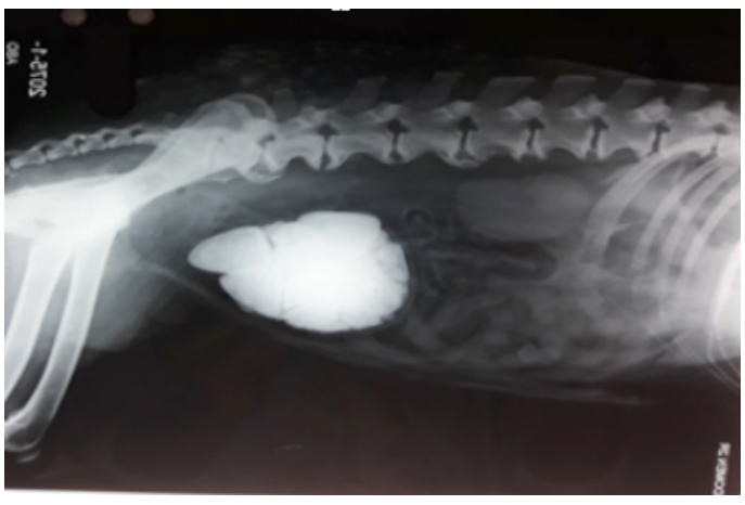
Figure 1: Abdominal radiograph (lateral) showing large uroliths inside the urinary bladder of the dog.

saline and some essential nutrients of vitamins in the 250 ml of normal saline injection.