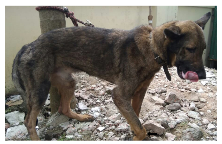
Figure 1: The dog was showing non-weight bearing posture of right forelimb (arrow).

An intact male German Shepherd dog aged 5 years at 26 kg body weight with poor body condition score (2/5) was brought to SAQ Teaching Veterinary Hospital, Chattogram Veterinary and Animal Sciences University, Bangladesh. The dog had a history of nonweight bearing lameness of right forelimb since 3 days due to accidental trauma. Physical examination revealed the dog was active and alert but non weight bearing lameness of right forelimb (Figure 1). Rectal body temperature (101°F), heart rate (90/min.) and respiration rate (28/min.) were normal; pink and moist mucous membranes with capillary refill time (CRT) was <2 second. On palpation of the affected limb, pain and crepitation of right elbow joint particularly in olecranon of ulnar bone were observed. A mediolateral radiograph of right elbow revealed transverse fracture of right olecranon which extended to articular surface of trochlear notch (Figure 2). Apophyseal fracture of olecranon was also found. Based on the clinical and radiographic findings, it was decided to perform tension band wiring and pinning for repairing of the olecranon fracture.