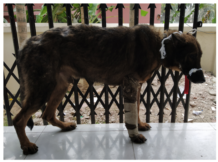
Figure 4: The dog was showing good weight bearing of the affected limb at 45 days of postoperative.

for external support. The external support is needed in whole limb for immobilization, prevent the pull of tendon of triceps muscle, minimizes external trauma and facilitate early fracture healing (Murthy et al., 2010; Nayak et al., 2012). On 45th day of clinical observations, the dog showed good weight bearing in right forelimb and walked normally (Figure 4). Even in heavy breed of dogs, tension band wiring in repairing of olecranon fractures provide rigid fixation and good clinical outcomes (Raghunath et al., 2008). If olecranon fractures are treated conservatively with external immobilization, the prognosis is unfavourable (O'Connor, 2005). In fact, complication of pin bending and breakage has been found when only intramedullary pinning has been used for repairing of olecranon fractures leading non-union to fibrous union (Denny, 1990).