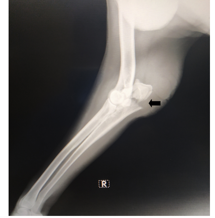
Figure 2: Preoperative mediolateral radiograph of right elbow revealed transverse fracture of olecranon (arrow).

The patient was fasted about 6 hours prior to surgery. Shaving was performed on surgical area and prepared the patient aseptically by using 7.5% providone iodine and 70% isopropyl alcohol. Xylazine hydrochloride was administered intramuscularly at the dose rate 1.0 mg/kg body weight as a pre-anesthetic agent. The patient was kept in left lateral recumbancy on operative table and normal saline (0.9% NaCl) was infused intravenously at the rate of 10ml/kg/hour. Ketamine hydrochloride was considered as general anaesthetic injecting intravenously at the dose rate 8.0 mg/kg body weight.