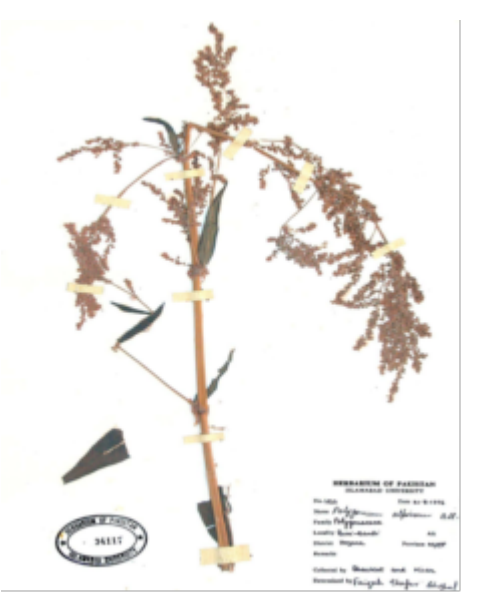
Figure 3: A. alpinum (All.) Schur. Flowering plant

A summary of pollen morphological characters of the three species of Aconogonon is given in table 2. Quantitative observations are recorded under light microscope (Figure 4-7). Scanning electron micrographs of selected species of the genera are presented in figure 8-11.