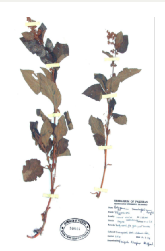
Figure 2: A. rumicifolium (Royle ex Bab.) Hara Flowering plant

March 2015 | Volume 31 | Issue 1 | Page 17