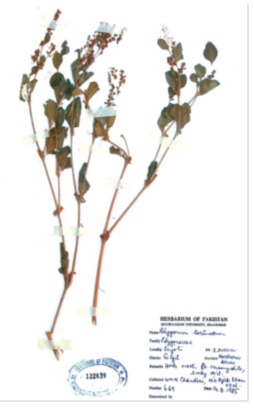
Figure 1: A. tortuosum (D. Don) Hara. Flowering plant