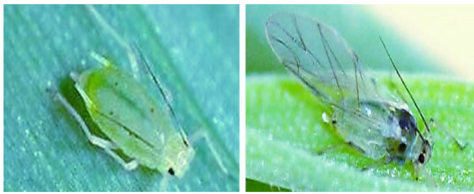
Figure 1: Apterous and alate morphs of wheat aphid Schizaphis graminum (Rondani, 1852).