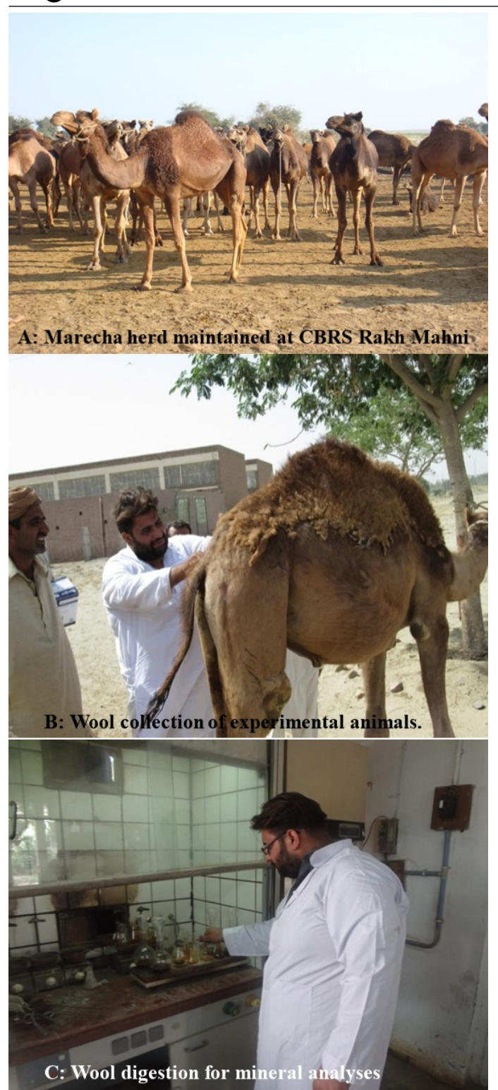
Figure 2: Wool collection and mineral analysis of Marecha camels.