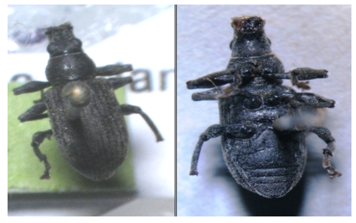
Figure 2: Dorsal view of Ptochus ovulum ventral view of Ptochus ovulum.