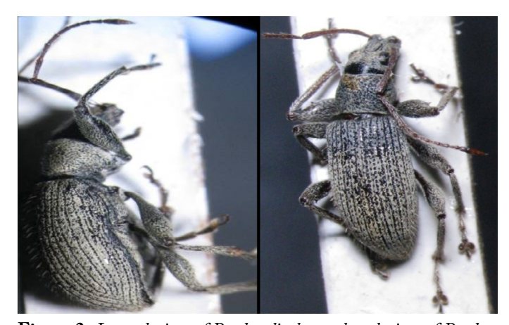
Figure 3: Lateral view of Ptochus limbatus dorsal view of Ptochus limbatus.