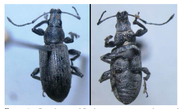
Figure 1: Dorsal view of Ptochus assamensis ventral view of Ptochus assamensis.

Comprehensive surveys were undertaken during active season between 2015-2017 to explore adult weevils from Himalayan foothills of Pakistan which revealed three new records for Pakistan. A total of 40 specimens were recorded from two host plants (Walnut tree and Khabal grass) and four different localities of district Islamabad and Rawalpindi. Details for each recorded species are discussed below in Figures 1, 2 and 3.