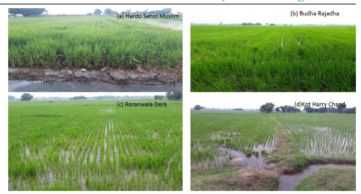
Figure 3: Direct seeded rice plots at different locations.

June 2020 | Volume 36 | Issue 2 | Page 606