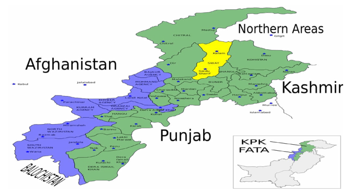
Figure 1: Sample study area in FATA, Pakistan (Shah et al., 2017).

the study area because the agency is very fertile for cultivation of vegetables and crops especially maize. Hence the idea was to study and observe the current situations regarding maize and identify different problems in its farming activities and to investigate the effect of modern farming practices on maize yield in the study area. The area of the Bajaur Agency is 1,290 square kilometers (www.thebajaur.com). Total cropped area reported is 68258 hectares, while total irrigated area of the agency is 13890 hectares. Wheat, barley, rice, maize, rapeseed and mustard are grown in the Bajaur Agency (FATA Development Statistics, 2013).