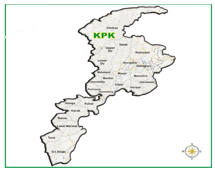
Figure 1: District wise distribution of Khyber PakhtunKhwa on map.

lies at 30° to 47'E, latitude and 69° to 74'E, longitude. Its elevation from the earth surface is 160m in Dera Ismail Khan and the highest is 1100 m in Chitral. Khyber Pakhtunkhwa province has been categorized into four agro- ecological zones specifically zone A, B, C and D (Inamullah and Khan, 2017). Zone A is the Northern mountainous zone including of Ranizai, Upper Dir, Swat, Buner, Chitral, Shangla and Lower Dir. Zone B is also known as Eastern mountainous zone. The Districts which belong to this zone are Toorghar (Kala Dhaka), Haripur and Abbottabad, Mansehra, Kohistan and Batgram. Zone C, sometimes also called Central Plain Valley consists of Swabi, Nowshera, Peshawar, Kohat, Mardan, Charsadda and Hangu. Zone D includes Dera Ismail Khan, Bannu, Karak, and Lakki Marwat and Tank Districts. It is also known as Southern Piedmont Plain. Due to these classifications the environmental climate of each zone are different in every aspects.