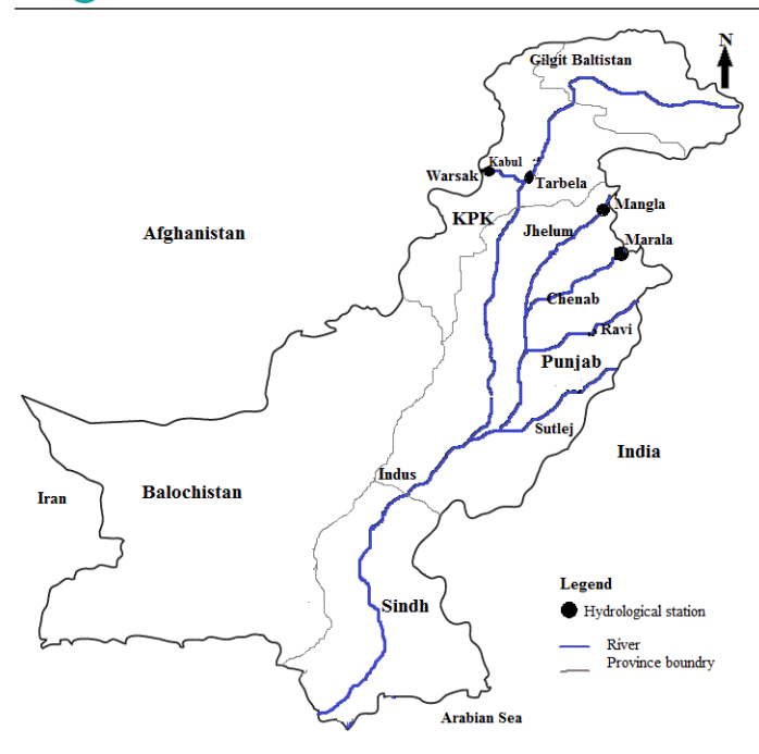
Figure 1: Indus River basin system in Pakistan.