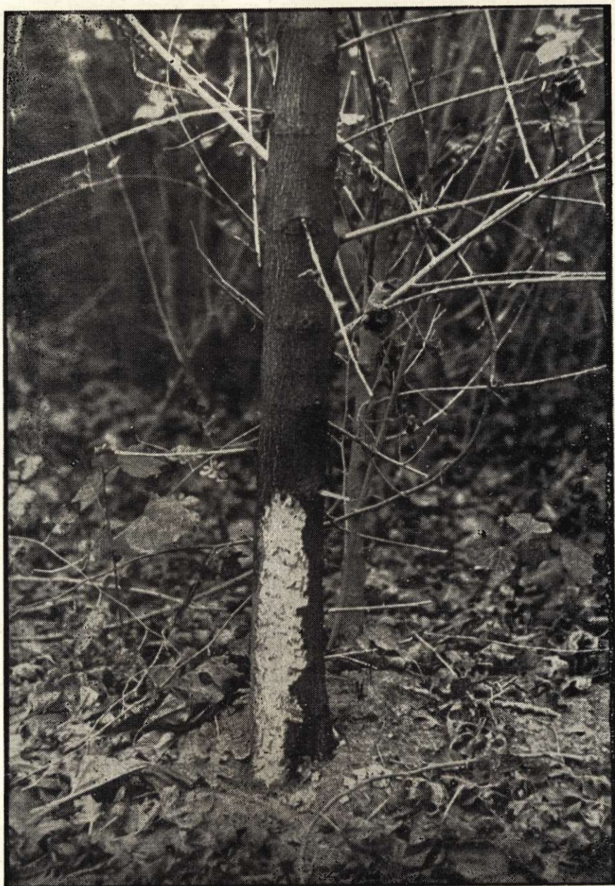
Fig. 2. Mulberry tree partially debarked by porcupine.