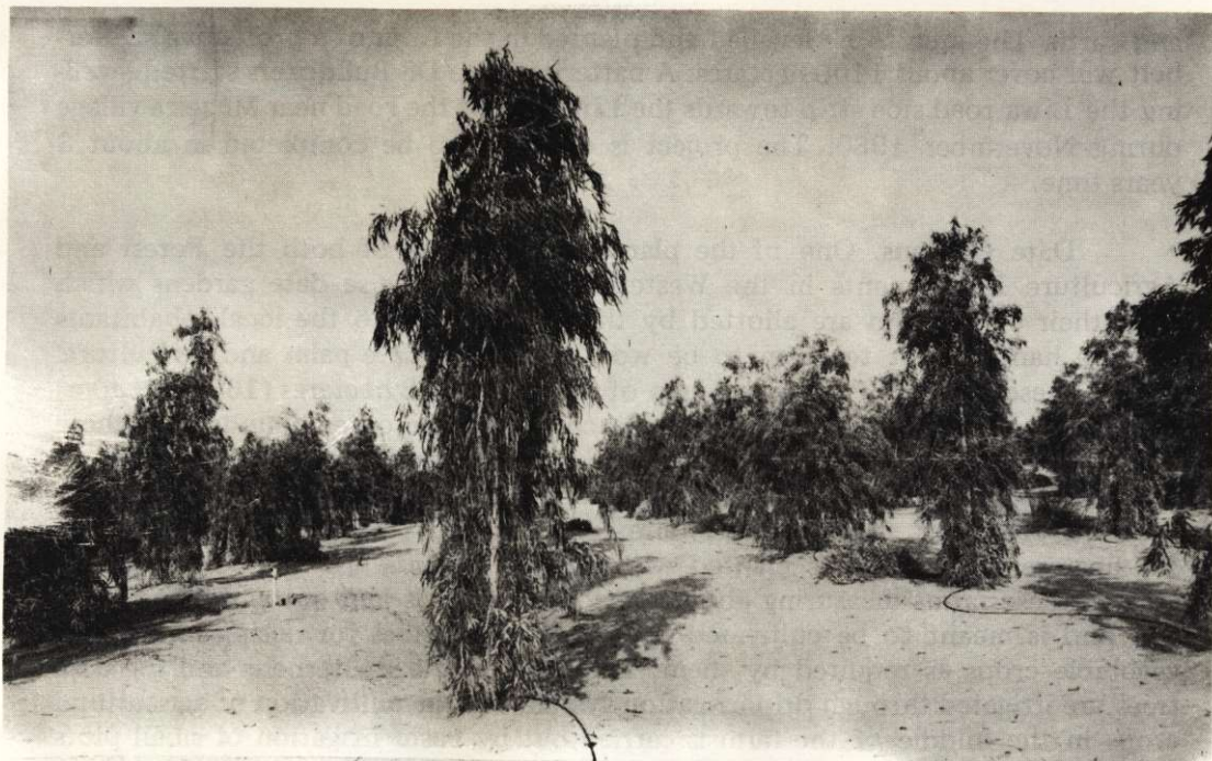
About 3-year old Eucalyptus shelterbelt at Al Babha along Tarif—Beda Zayed road, Abu Dhabi Emirate.