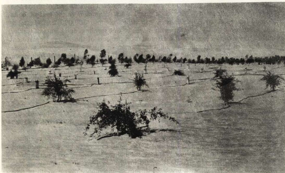
About 1-year old "Rak" ( Salvadora persica ) plantation raised with drip irrigation at Safran, Abu Dhabi Emirate.