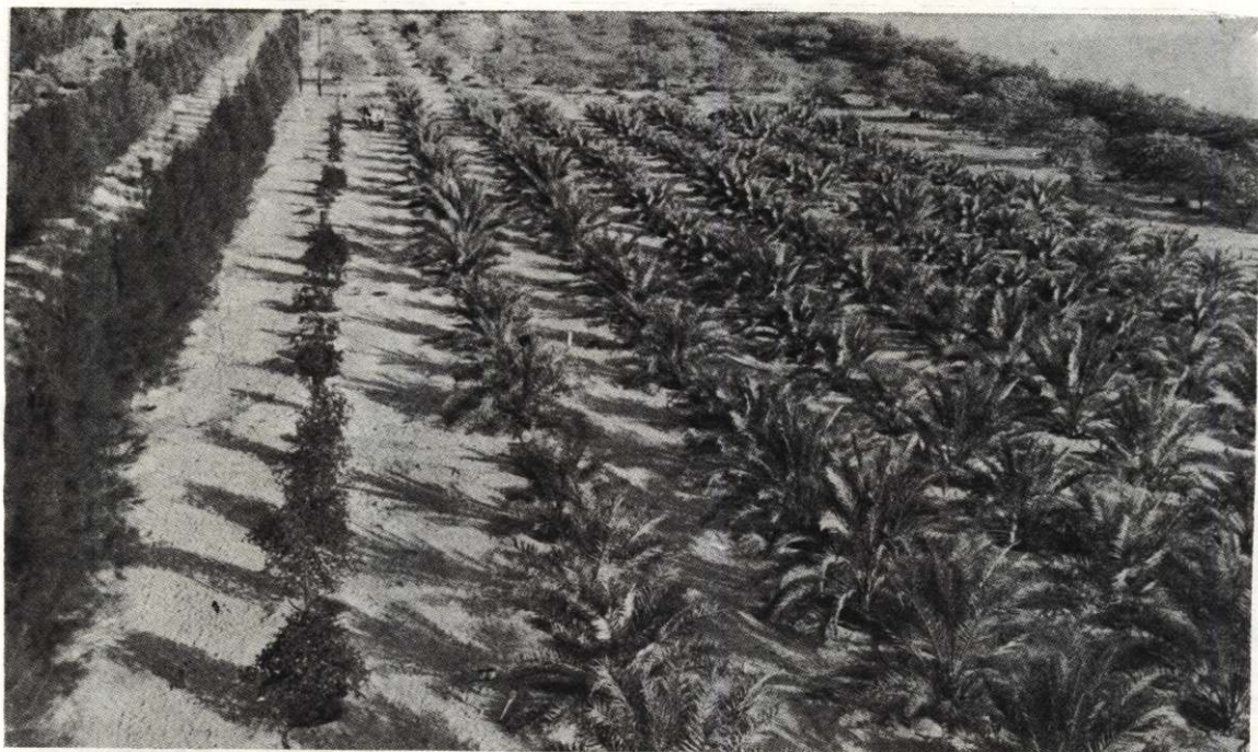
Fig. 3. Madina-Zayed plantation showing dates and other planis.