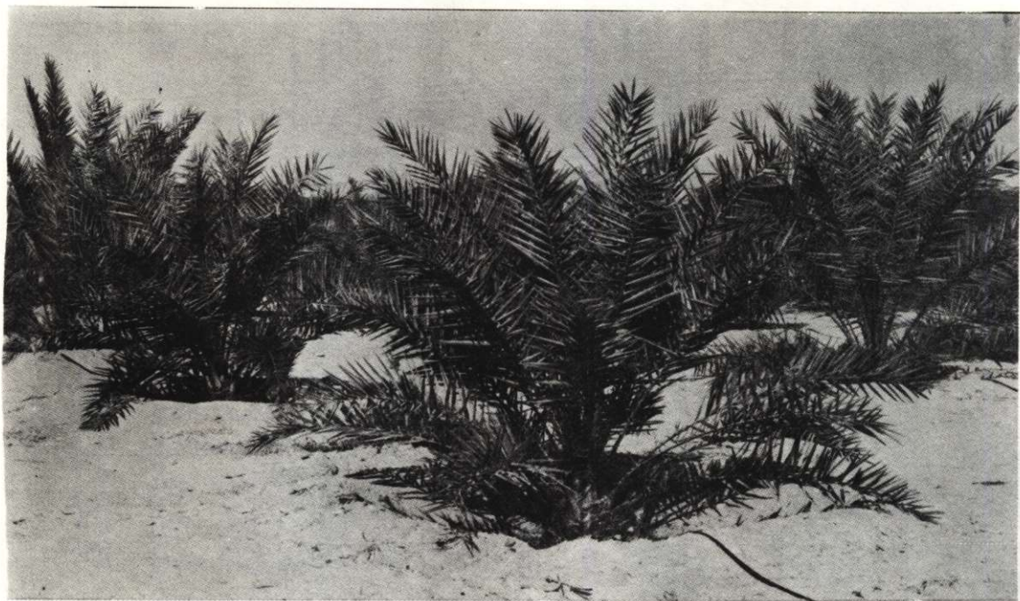
Fig. 4. A young date plantation raised with drip irrigation, Abu Dhabi.