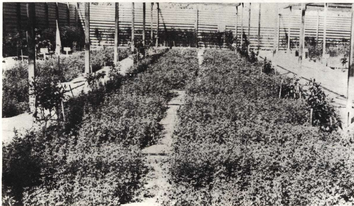
Fig. 2. Al Bujair Nursery with grown up plants, Abu Dhabi.