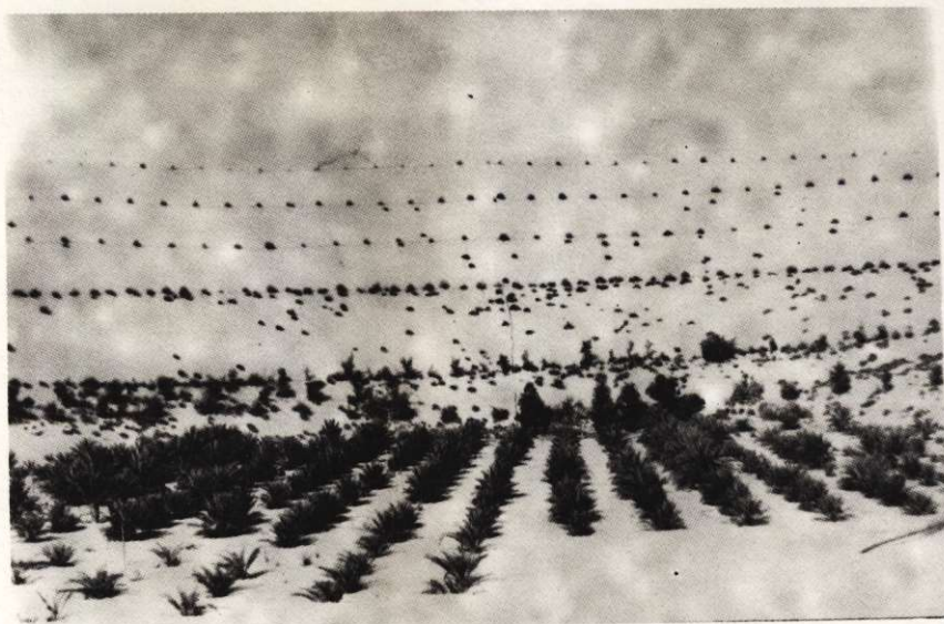
Fig. 3. A young date plantation at the foot of a sand dune at Beda Saif. Planting has been done to stabilize the dune.