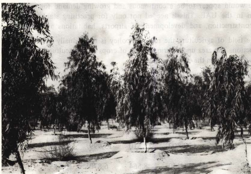
Fig. 1. Eucalyptus shelterbelt raised in Al-Babha plantation, Abu Dhabi.