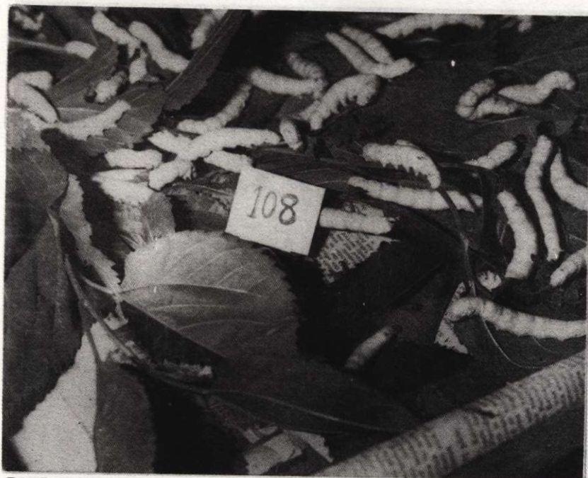
RACE: M 108