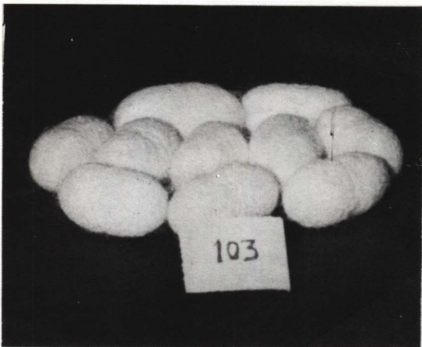
RACE: M 103