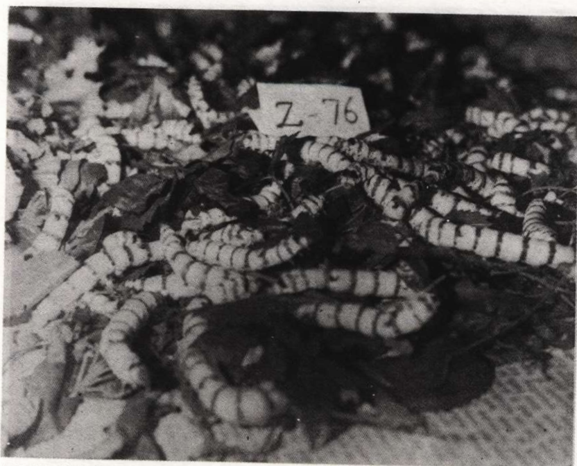
RACE: ZM 76