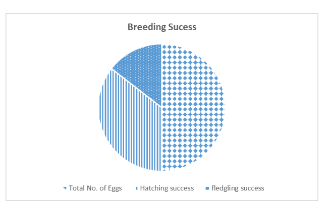
Fig. 2. Breeding Success (Total no. of eggs, hatching and fledgling) of spotted dove in Village Takoro.

was human predation on nests (i.e., removing young from cavities), predators (i.e., snakes, civets, cats, and crows) (42.85%) and other egg loss was (13.26%).