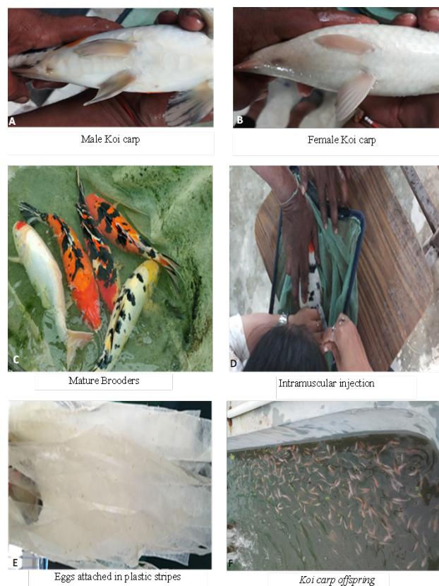
Fig. 1. Procedure followed in the captive breeding of Koi carp using RAS facility.

and nylon fibres. Nylon fibres act as a substrate to attach the eggs because Koi carp eggs are adhesive in nature.