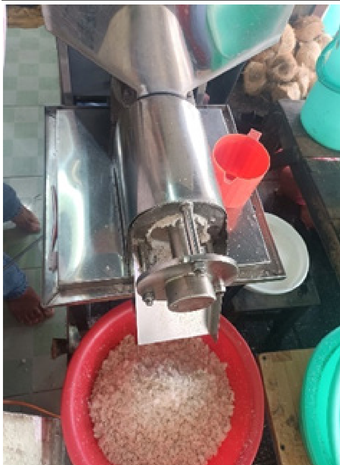
Figure 3: Coconut meat waste.

The DM intake (kg/animal/day) in this study was not different ( P>0.05 ) between treatments but it tended to lowest value in CMW75 (5.69 kg). In detail, the proportion of DM intake per BW (Figure 4) was not different ( P>0.05 ) at CMW0 and CMW25 but it gradually decreased at CMW50 and CMW75 treatments (1.64, 1.65, 1.50 and 1.47%, respectively). The DMI/BW of cattle in this