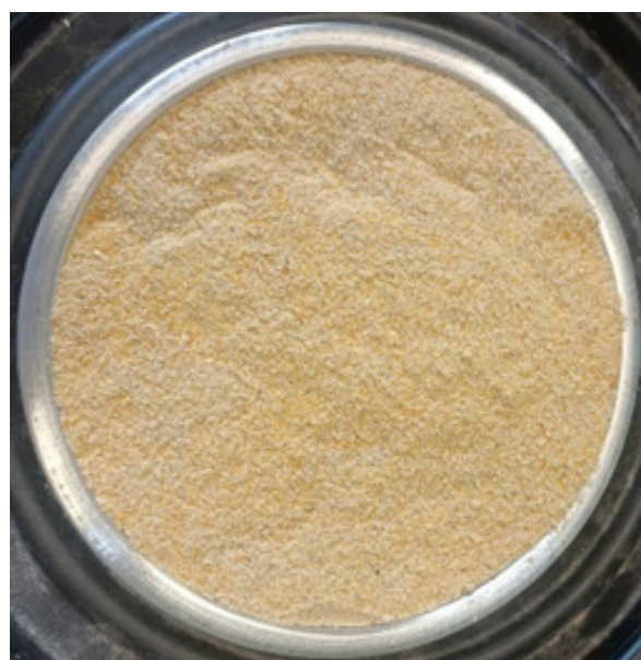
Figure 2: Maize.

The nutrients of feed, refusals and feces were analyzed for dry matter (DM), organic matter (OM) and crude protein (CP) in the procedure of AOAC (1990). However, the neutral detergent fiber (NDF) and acid detergent fiber (ADF) were determined standards by Van Soest et al. (1991).