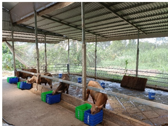
Figure 1: The Charolais crossbred cattle in this study.

7:00 am and 1:00 pm. The elephant grass was fed twice at 8:00 am and 2:00 pm. Both rice straw and freshwater were supplied ad libitum . Each morning, refused feeds and freshwater were weighed. The daily feed intake and nutrient consumption were determined from feed and refusals.