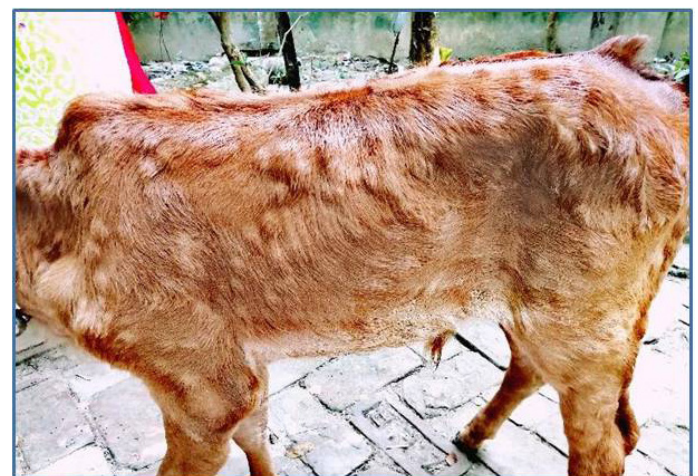
Figure 1: LSD diagnosed in a showing typical large circumscribed lumps of variable size covered all over the skin.