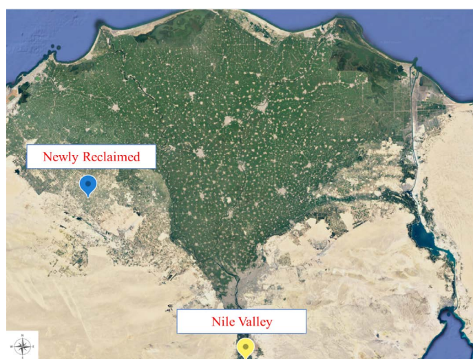
Figure 2: Map of Lower Egypt showing the study locations of Nile Valley and Newly Reclaimed districts