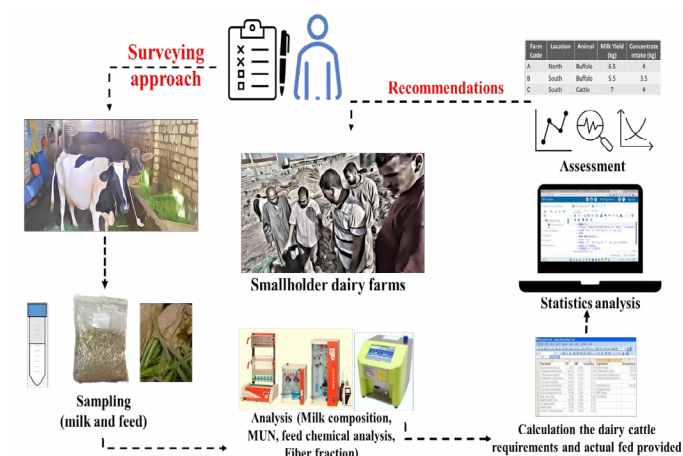
Figure 4: Assessment feeding practices protocol at smallholder dairy farm.

In Figure (4) Clearfield the protocol that could be conducted at smallholder dairy farms to check and aliment the feeding practices to achieve good profitability at on a small scale. The suggestion assessment protocol was started with survey analysis merged with milk sampling and analysis for feed and milk. Calculation for nutritional requirements was conducted to identify the nutritional gap through statistical analysis and standardized parameters. Farms parameters deviations from standards were considered to formulate recommendation for farmers.