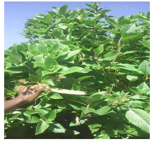
Figure 1: Penta schimperiana plant. D D D D D D D D D D D D D D D D D D D D D D D D D D D D D D D D D D D D D D D D D D D D D D D D D D D D D D D