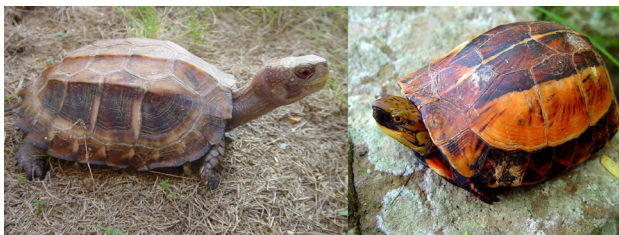
Fig. 1. External morphology of Cuora mouhotii (left) and C. galbinifrons (right).