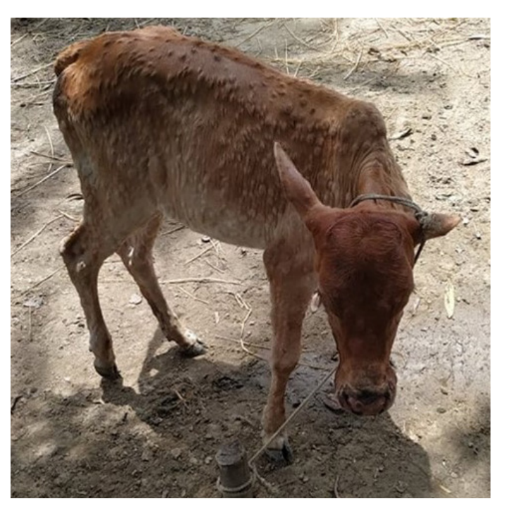
Figure 1: LSD in a calf (image was taken during an outbreak of LSD in 2019 at Pekua, Cox's Bazar, Bangladesh). The entire body was covered with multiple nodular skin lesions.