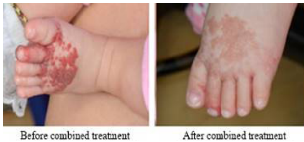
Fig. 3. Comparison of children in the combined treatment group before and after treatment.

Six months after treatment, the hemangioma treatment effect in the two groups was compared and evaluated. The conventional treatment group 30 (75.00%) had lower tumor growth arrest rate than the combined treatment group 37 (92.50%) ( P < 0.05 ). The combined treatment group had increased significant relief rate in tumor depth 32 (80.00%) compared with the conventional treatment group 21 (52.50%) ( P < 0.05 ). The combined treatment group had increased rate in shallower tumor color 36 (90.00%) compared with the conventional treatment group 25 (62.50%) ( P < 0.05 ). The conventional treatment group had lower tumor area reduction rate 27 (67.50%) than the combined treatment group ( P < 0.05 ) (Fig. 3, Table IV).