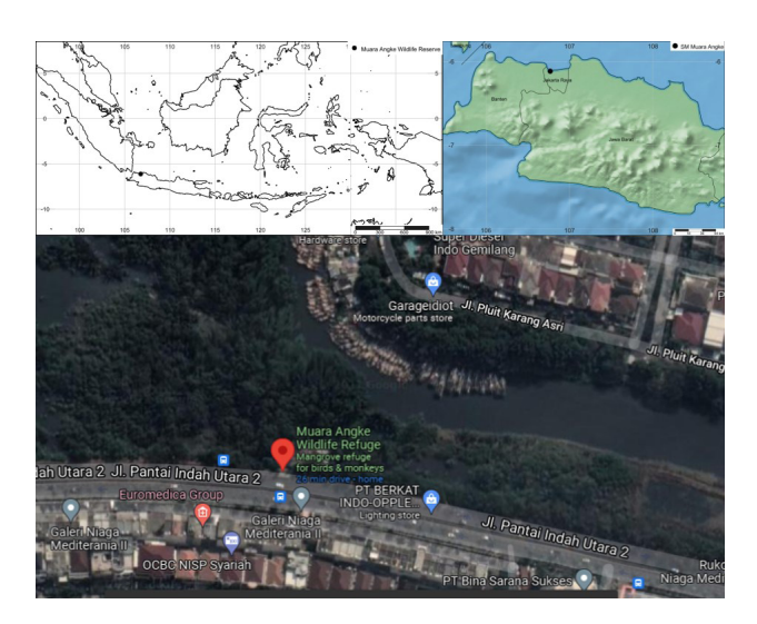
Fig. 1. Muara Angke Wildfire Reserved (David, 2010).

In general, this fish is resident of a river with a medium to large size lakes and swamps. Usually found swimming not far from the vegetation of aquatic plants. As for the food are several types of insects, worms, shellfish, crustaceans, algae and parts of plants (Haryono et al., 2015; Froese and Pauly, 2021). In terms of reproduction, balashark fish experience gonad maturity which is influenced by rainfall which causes low water temperature, then after maturity the female fish gonads will release eggs and will be fertilized by males. The fish eggs produced are around 3,000 to 12,000 eggs which hatch in about 13 h (Baras et al., 2007). Furthermore, the distribution of the balashark was recorded in Asia, namely in Peninsular Malaysia, Thailand, Cambodia, Laos, and Indonesia in Sumatra and Kalimantan (Kottelat et al., 1993; Froese and Pauly, 2021). However, this species was recorded in swampy waters within the Muara Angke Wildlife Reserve area of Jakarta. Whereas in terms of local distribution, Java and especially DKI Jakarta are not included in the natural distribution of this fish.