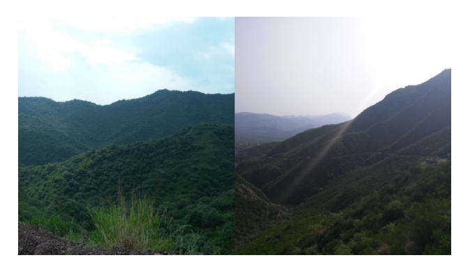
Fig. 3. Habitat potential of Nowshera District.

The successful ex-situ conservation shows that the climate and habitat (Fig. 3) in Nowshera district are very suitable for the wild ungulates. Chinkara, now found in semi-wild habitats of Nizampur area, was reintroduced by the wildlife department KP. Likewise, Urial are also flourishing in ex-situ conservation with the aim of reintroduction under the auspices of wildlife department KP (Khattak et al. , 2019b, 2020). The presences of both these species was once confirmed in Noswhera District by Malik (1987). Three species of bats reported in the current inventory were also confirmed by (Rahman et al. , 2015).